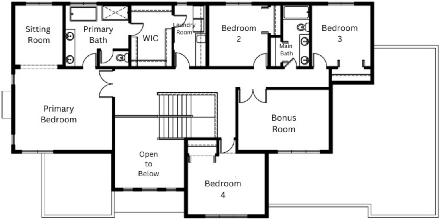
Vine Lot 11: Upper Floor